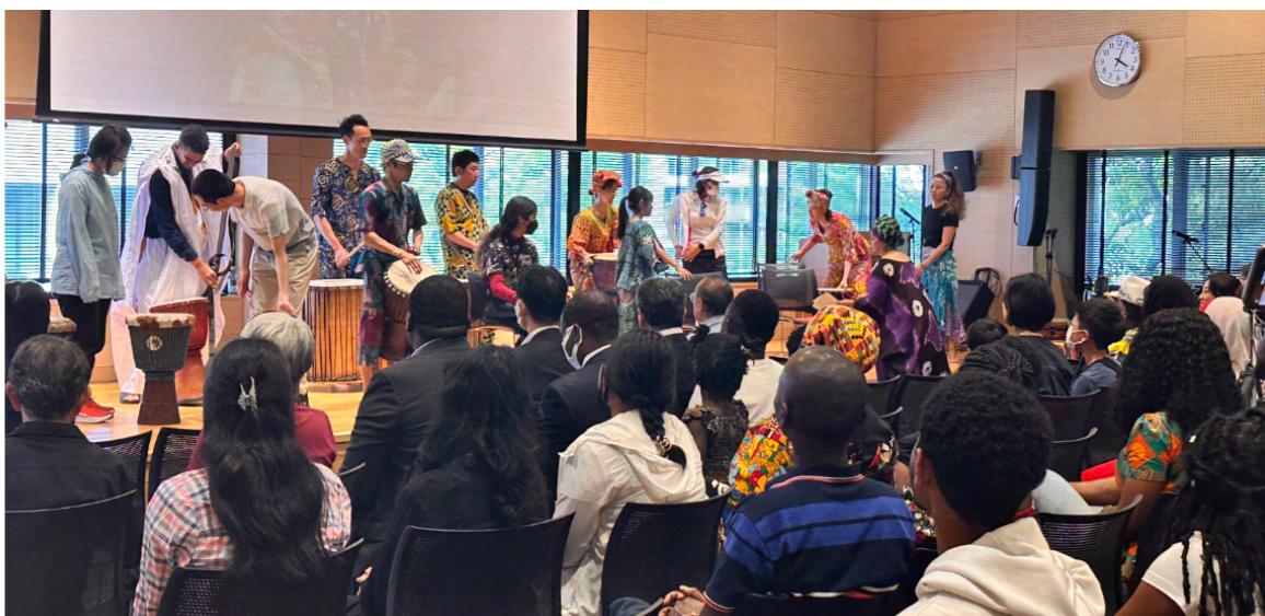
Djembe Group Performance

Approximately 190 participants attended the event, creating a lively atmosphere of excitement and cultural appreciation. The attendees, comprising students, faculty, and local community members, were immersed in a celebration that fostered cross-cultural understanding and promoted diversity on campus. Through this event, the African Students Association succeeded in fostering a sense of pride and appreciation for African culture among attendees.