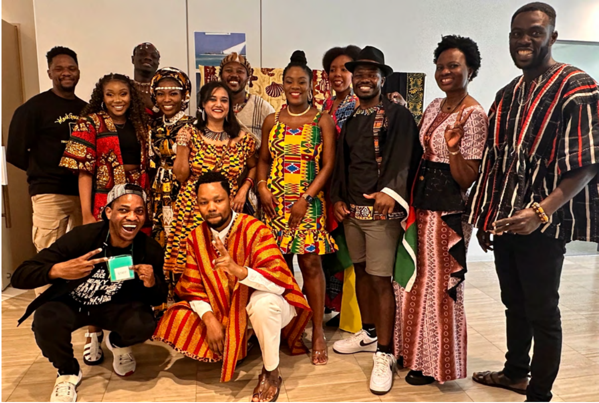
African Fashion Show Models (Nagoya University Students)